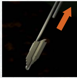
Remove Drive Steel