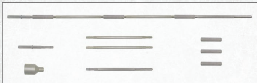
Manta Ray Anchor Drive Steel